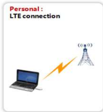
Figure 3-1 shows the device connecting to the network by USB.

After you connect the E8372 to a PC with the USB interface, you can send or receive E-mail, access the network through wireless connection, and download files through wireless data channels.