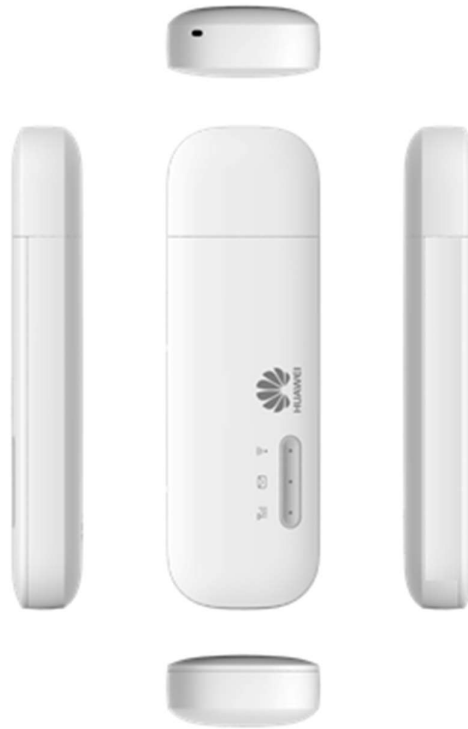
Figure 1-1 E8372 profile

Figure 1-1 shows the profile of the E8372.