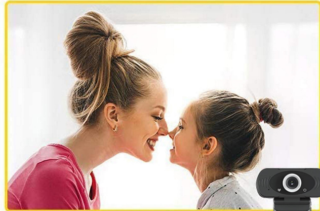
HDR Video Algorithm: Still clear behind the backlight