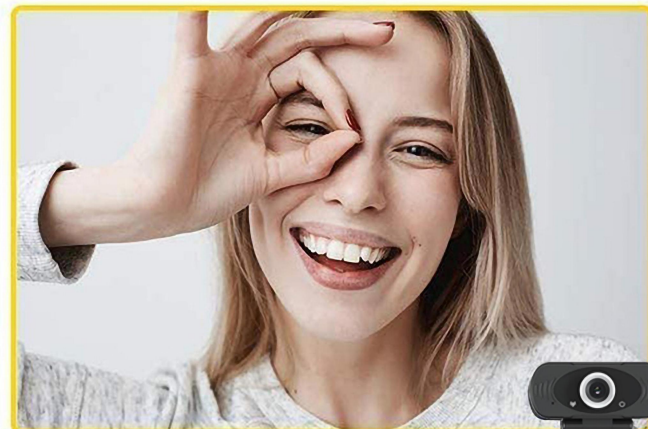
Hardware Beauty Effect: More natural and beautiful